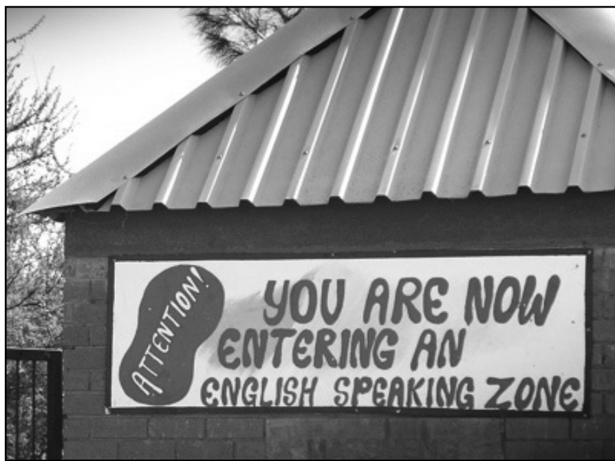
Theresa Rogers, 2005

The teachers' final suggestion is that they should model speaking behavior better in and out of class. This point is related to what many junior secondary schools in Botswana have proposed — the school environment as an English speaking zone. The photograph below illustrates this point: