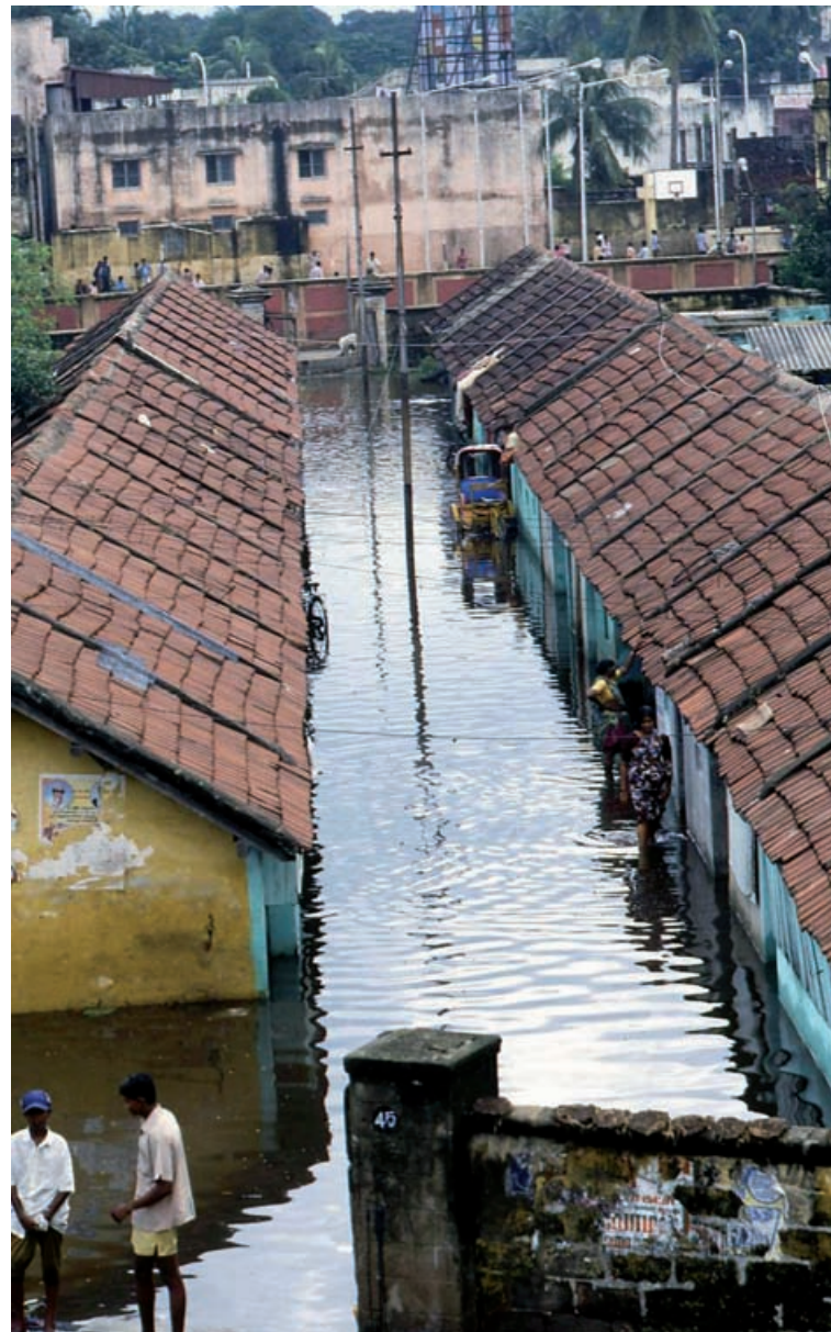
With most of Chennai, India being flat, floods can happen within six minutes from the start of a sustained burst of rain.