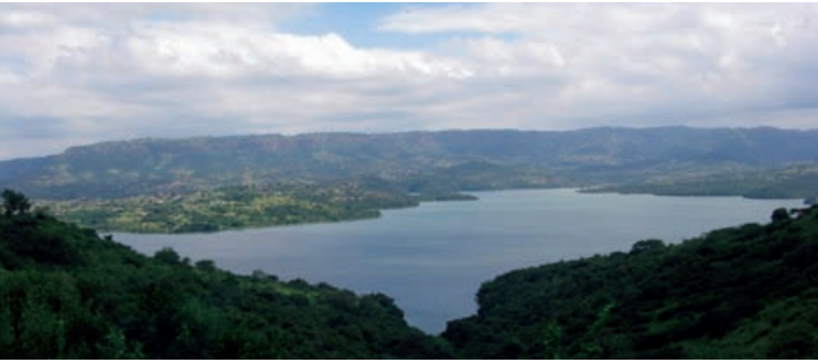
River Basin South Africa.

The approach followed by the teams in the process of developing the different NAPAs is guided by some basic principles, including that the process 'should have a country-driven approach and be a participatory process involving multi-stakeholder consultation, reflecting a true bottom-up approach'. In addition, the process should involve a multidisciplinary group of experts, and undertake comprehensive and integrated assessments and it should