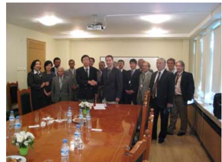
(Left) Kickoff meeting in Tokyo, June 2007, (Right) The 2 nd session of the IPRED in Istanbul, July 2009