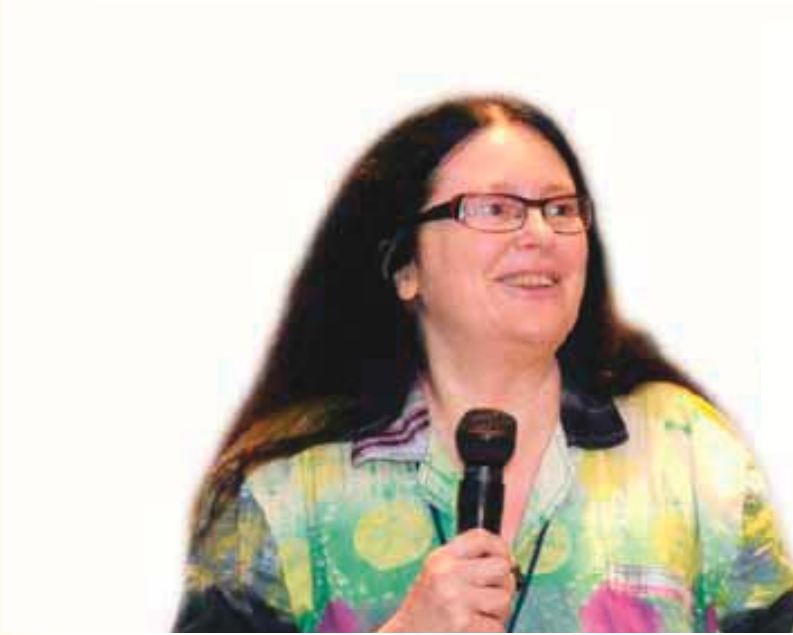
Gretchen Kalonji UNESCO

'We should integrate schools and communities into the scientific agenda through contributions to data collection studies.'