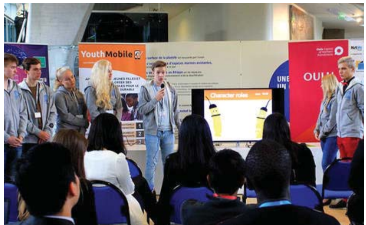
Oulu City students demonstrating the new 'Aaro's Adventure' mobile game aimed at youth to preserve the world's oceans. The game is based on oceanographic data from the Finnish Meteorological Institute and the UNESCO's Intergovernmental Oceanographic Commission ARGO Initiative. The App raises the player's awareness about the world's oceans protection and the sustainable future of our planet through a series of mini-games.