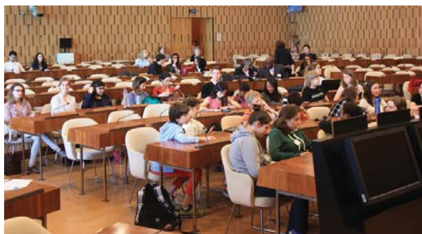
Middle school students attending the UNESCO "Ocean" Campus.

The UNESCO Campus is part of a series of thematic conferences organized by UNESCO. The idea is to educate youth about current social, educational and environmental challenges, thus helping them to grow as responsible citizens. Six UNESCO Campus on the ocean have been organized between 2014 and 2016. 1800 young people have participated in these events so far.