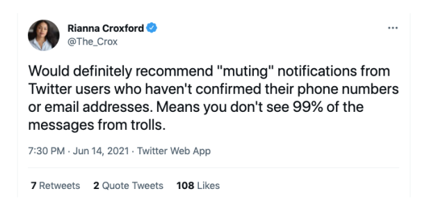
Figure 1: After being targeted, BBC Investigations reporter Rianna Croxford adjusted her Twitter settings so as not to be notified about all tags. "My [Twitter] notifications are now set in a way now that...if people comment and I don't know them, or I don't follow them, then I don't see it." <sup>11</sup>

There have been many policy announcements from the platforms regarding online abuse and harassment. Most interviewees dismissed these efforts as 'PR exercises', while also welcoming a number of platform initiatives. For example, Twitter's 2021 rollout of features such as allowing users to limit the ability of non-followers to reply to tweets and the option to remove followers was welcomed by a number of journalists, who said they now feel "safer" on the platform.